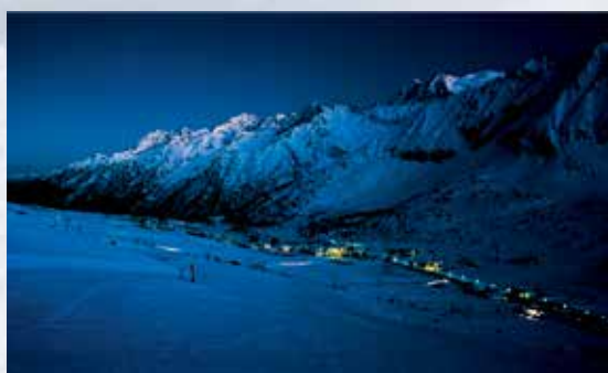
Night life at Passo Tonale